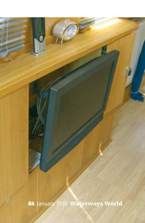
Below, from left: TV system discretely mounted in locker. Aft utility room with multiple gauges for tanks. Bespoke shower tray set in cool marble-effect bathroom.

Middlewich Narrowboats (01606 832460, www.mbnarrowboats.co.uk , www.middlewichboats.co.uk )